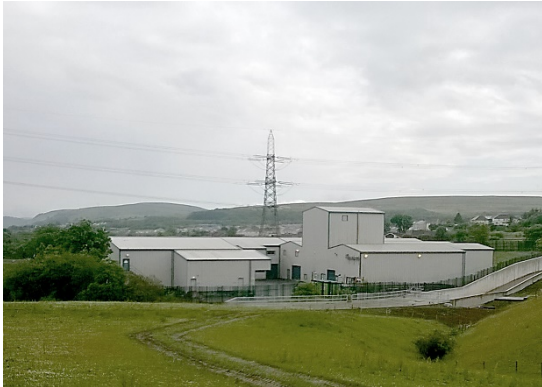
Picture 1: A water treatment works (WTW) in South Wales has had its control system completely upgraded, without any disruption of supply to the 70,000 people it serves.